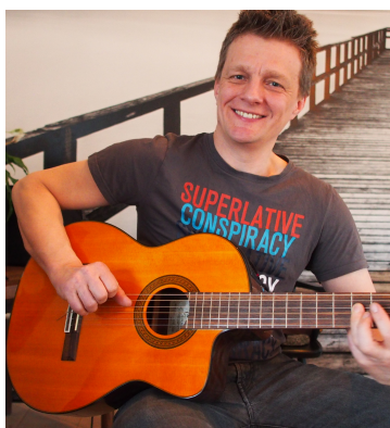
Ariel Striim Strandteatern Musician SV/DK