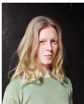
Celeste Borchorst Faursschou Actress/DK